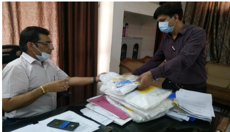
PPE kits supplied to Government Institute of Medical Sciences, Noida