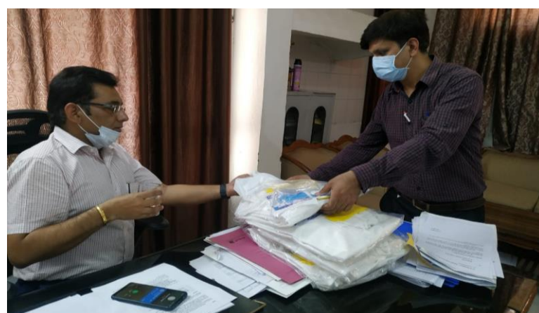
PPE kits supplied to Government District Hospital, Gurugram

SEEDS needs your kind support for reaching out to 1 million persons in underprivileged communities across India