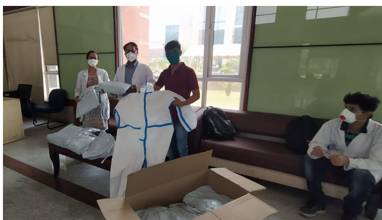
PPE kits supplied to Government Institute of Medical Sciences, Noida

The spread of coronavirus world-wide has drawn huge demand and urgent requirement of personal protective equipment in large numbers for all those working in high risk environments such as the doctors & nurses, police personnel and others working in the field. SEEDS therefore made a sincere endeavour and collaborated towards a substantial contribution by supplying 1880 personal protective equipment kits including N-95 masks for the frontline health workers in the below mentioned hospitals in Gurgaon and Noida.