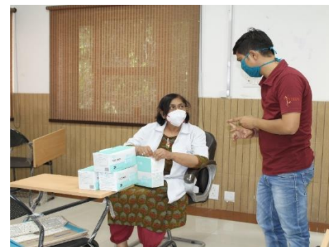
Undershirts and masks distributed at Lal Bahadur Shastri Hospital, East Delhi

In order to help and support the front line warriors such as policemen, nurses and doctors who have been striving hard to fight against Coronavirus, SEEDS distributed comfortable undershirts and face masks to the policemen, medical staff (working in Covid-19 hospitals and otherwise) as well as the Civil Defence volunteers who are on the ground from day one. A total of 1730 undershirts, 1775 non-woven masks have been distributed in Delhi-NCR so far