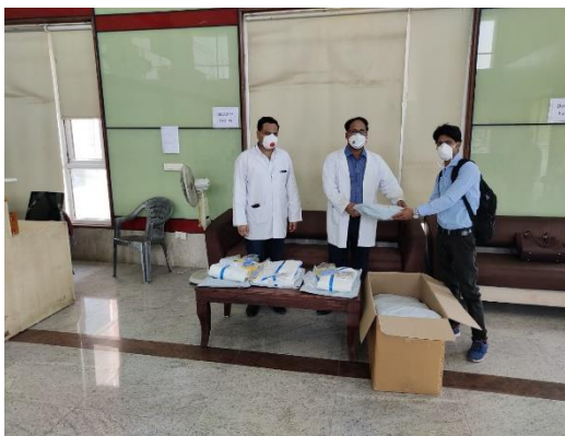
PPE Kits distribution at GIMS, Noida, Uttar Pradesh

In order to help and support the front line warriors such as policemen, nurses and doctors who have been striving hard to fight against Coronavirus, SEEDS distributed comfortable undershirts and face masks to the policemen, medical staff (working in Covid-19 hospitals and otherwise) as well as the Civil Defence volunteers who are on the ground from day one. A total of 1730 undershirts, 1775 non-woven masks have been distributed in Delhi-NCR so far