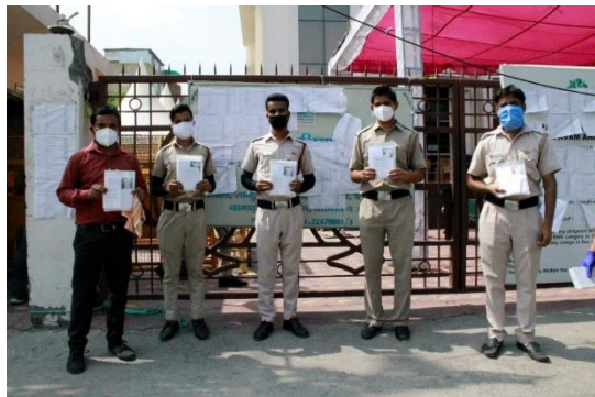
Undershirts and masks distributed at DCP Office Complex, East Delhi